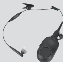
NNTN8294 (Wireless Pod not included)

Wireless accessories give you the flexibility to remove the radio from your belt and stay connected within 30 feet. We've embedded Bluetooth in to your XPR 7000 Series radio so no adapter is needed. A full portfolio of wireless accessories are available to meet your specific business needs. The XBT Heavy-Duty Wireless Headset is the state-of-the-art digital headset that unleashes the power of MOTOTRBO radios to shield you from harmful, high-decibel noise while letting you hear the sounds you need to – people, alarms, alerts and more.